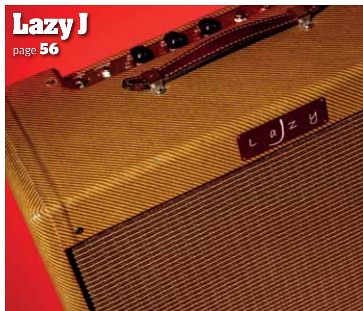
Lazy J page 56