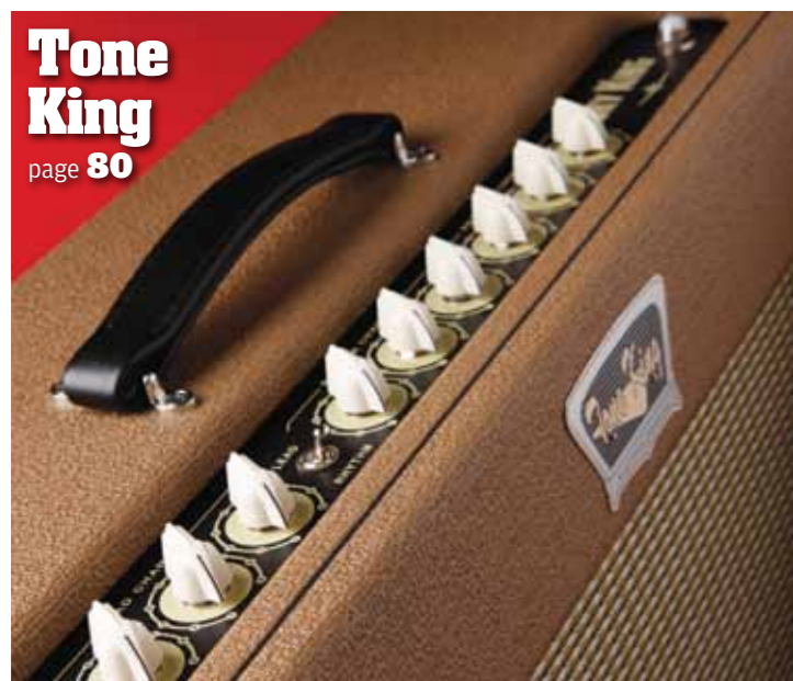
Tone King page 80