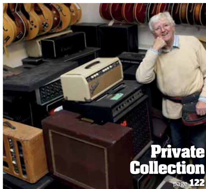
Private Collection page 122