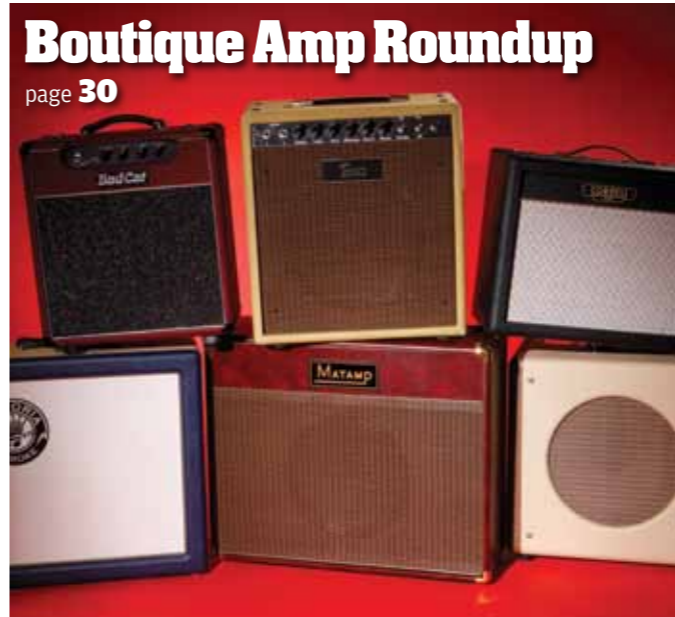
Boutique Amp Roundup page 30