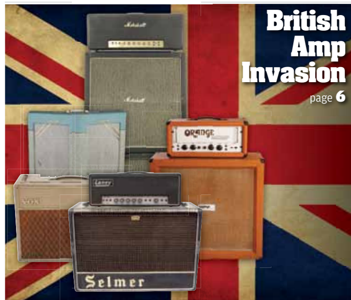
British Amp Invasion page 6