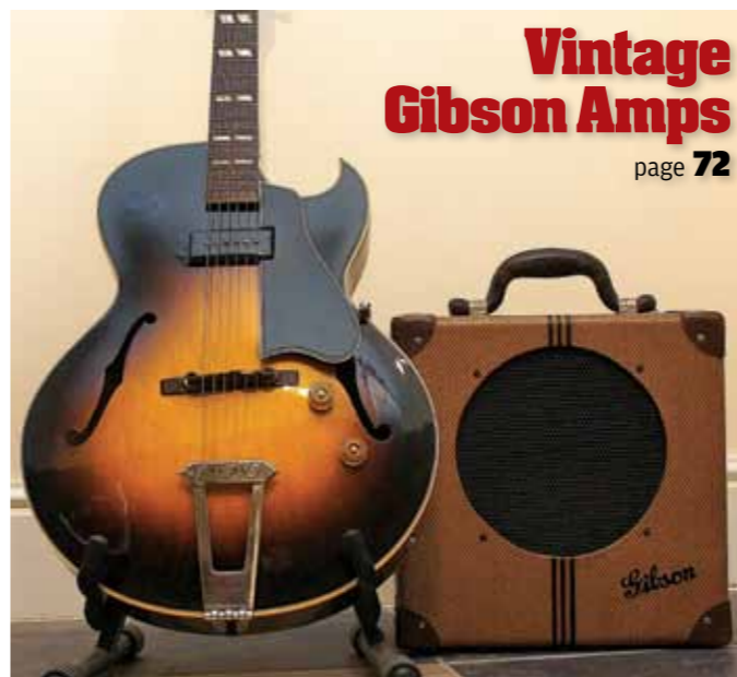
Vintage Gibson Amps page 72