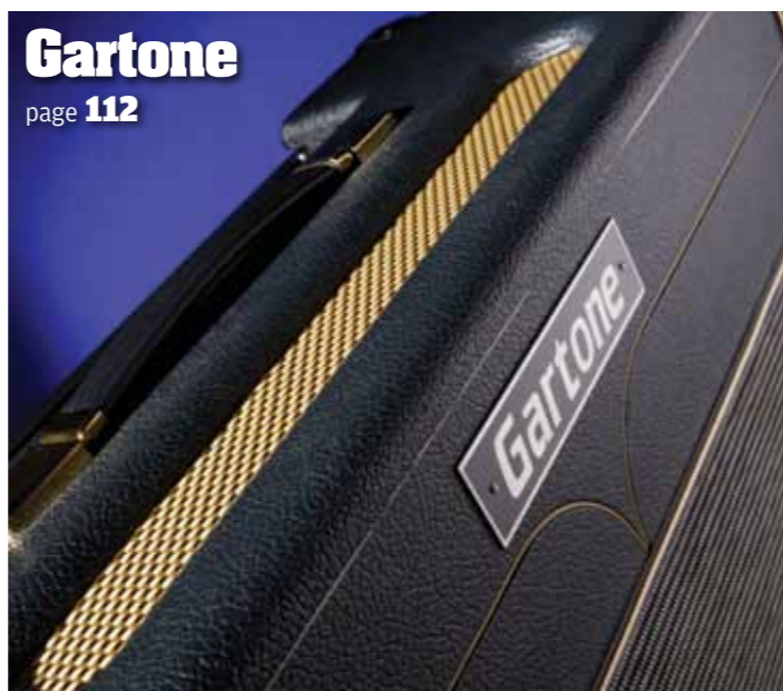
Gartone page 112